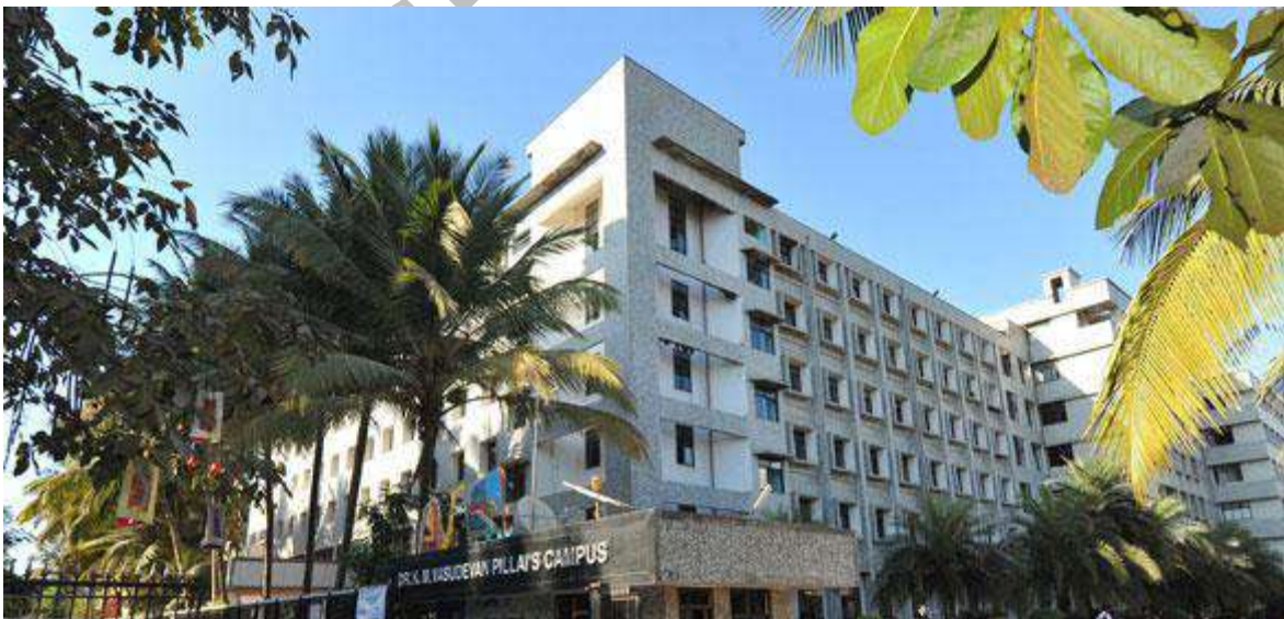
Dr. K. M. Vasudevan Pillai's Campus, Sector - 16, New Panvel – 410 206

To develop professional engineers with respect for the environment and make them responsible citizens in technological development both from an Indian and global perspective. This objective is fulfilled through quality education, practical training and interaction with industries and social organizations.